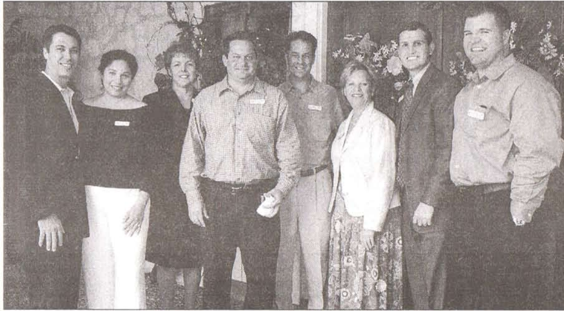
Local business and professional leaders gathered for the first mixer of the Leon Springs Business Association.